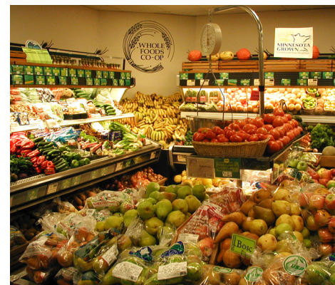
Interior of 1332 East 4th Street location