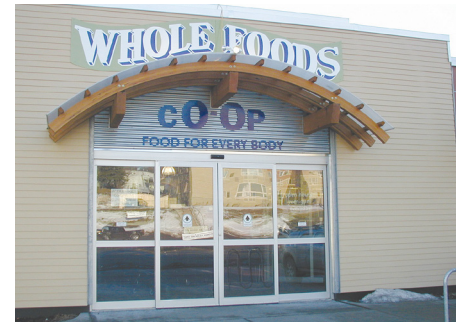
610 East 4th Street, 2005–Present

The Co-op has made a few physical moves throughout the years but made many more important strides in becoming a good neighbor, community member, and trusted grocer; some of these include being LEED certified in 2006 and becoming a Certified Organic Retailer in 2007. What often sets the Co-op apart is the ability to make lemonade out of lemons, organic lemons of course! The “Great Flood of 2012” which caused severe damage throughout the community took out the retaining wall and a portion of the parking lot at the Hillside location. This destruction paved the way for growth, with the addition of the open-air Brewery Creek Overlook seating area. But the real growth was not visible to those who just drove by, the real growth at the Co-op was through community outreach.