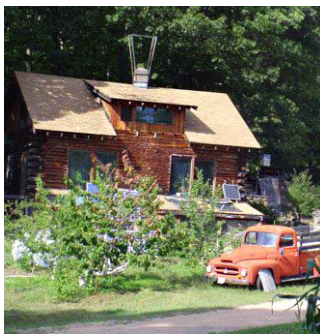
North Wind Farm, Bayfield, WI

We are lucky to have multiple local orchards in the northland. Many of them supply the Co-op with apples, such as Paul's Memorial Orchard in Two Harbors, MN, and Dixon's Orchard in Cadott, WI. Other orchards, like North Wind Organic Farm, produce delicious, locally pressed apple ciders!