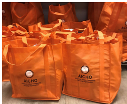
Urban gardening and food distribution are part of AICHO's food sovereignty initiative to reclaim healthy and Indigenous foods.

Established in 1993, the American Indian Community Housing Organization (AICHO) has operated successful programming including emergency shelter, supportive housing, and community support services. AICHO's mission is to honor the resiliency of Indigenous people by strengthening communities and centering Indigenous values in all aspects of their work.