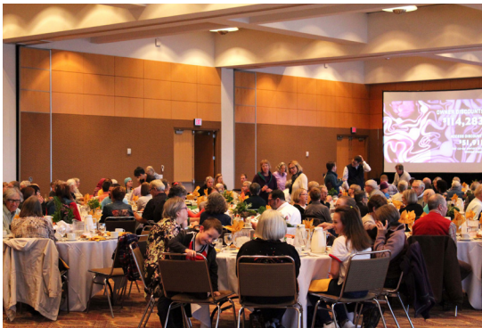
2018 Annual Owner Meeting

The Annual Owner Meeting is a time that is dear to our Co-op and our Owners. We share food, we celebrate the business, and all the people who make it possible. If you've attended one of these events, you know the sweetness of a meal shared with Co-op family and friends. And if you're new to the Co-op, or haven't yet made it to an Owner Meeting, join us. The meeting always proves to be a showing of passion for and dedication to the Co-op.