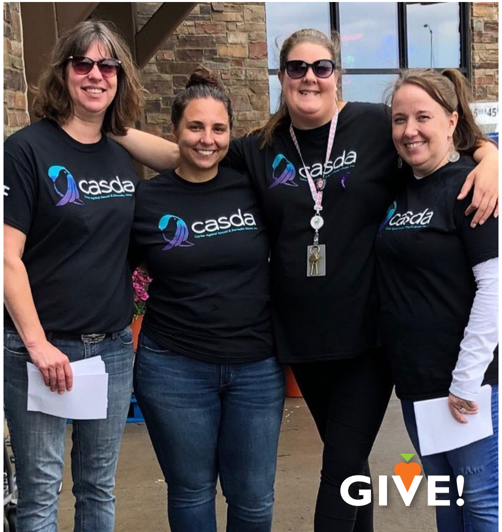
CASDA (Center Against Sexual & Domestic Abuse) + Grow Local Food Fund are the GIVE! Round Up recipients for October 2022. PAGE 7