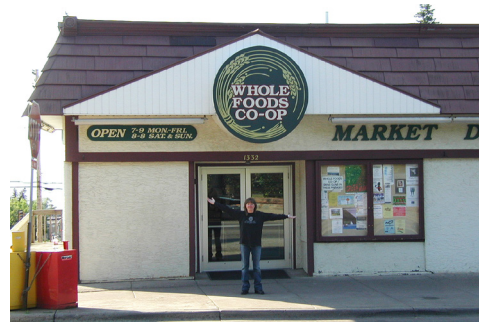
1332 East 4th Street, 1993–2005