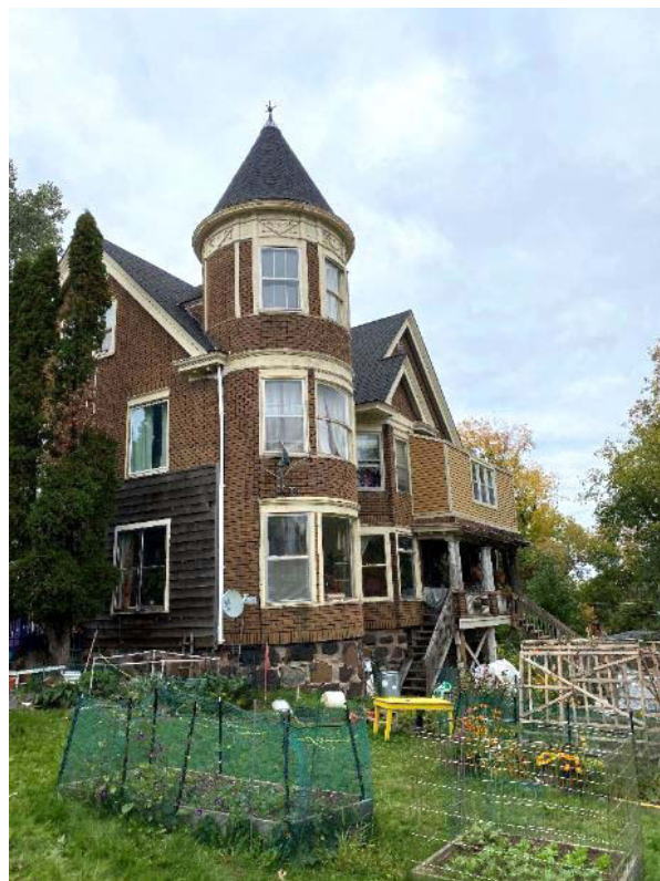
The "Chester Creek House," 13th Avenue East and 2nd Street