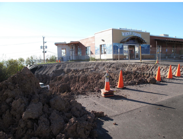
The “Great Flood of 2012,” destroyed a portion of the parking lot at the Whole Foods Co-op Hillside store.