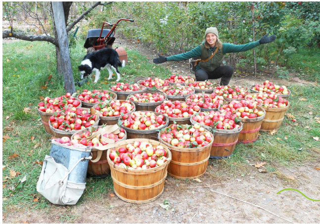
Apple harvest at North Wind Organic Farm

Northern Minnesota and Wisconsin have one of the best climates for growing apples.