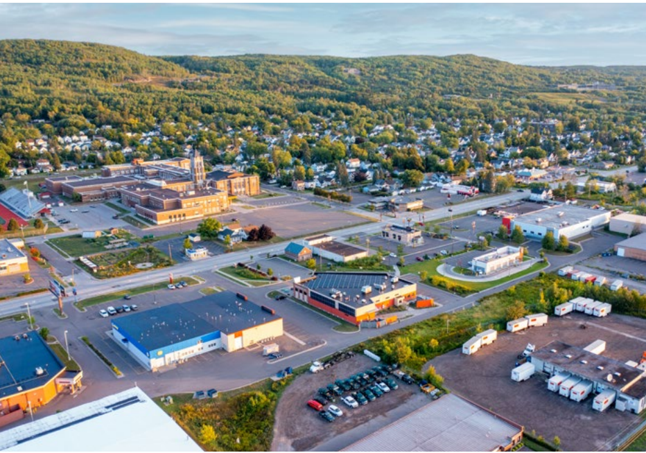
Photos by Dangerbird Productions , a Duluth-based videography and photography company.