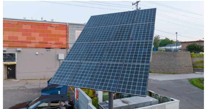
16-panel solar array at the Hillside store.

and tax incentives that could be harnessed to mitigate costs of our impact project; such as a recent federal tax credit enabled by the Inflation Reduction Act that should return 30-40% of the project cost to WFC. Project financing was secured through the Saint Paul Port Authority's Property Assessed Clean Energy (PACE) program , which provides low-interest loans to be repaid via property tax assessments with the electricity savings.